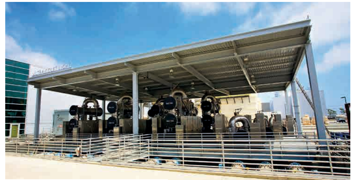
Above: UV advanced oxidation is a core process at the Orange County Water District's Groundwater Replenishment System. This application of UV-AOP uses hydrogen peroxide to generate hydroxyl radicals that degrade organic contaminants present in the water.